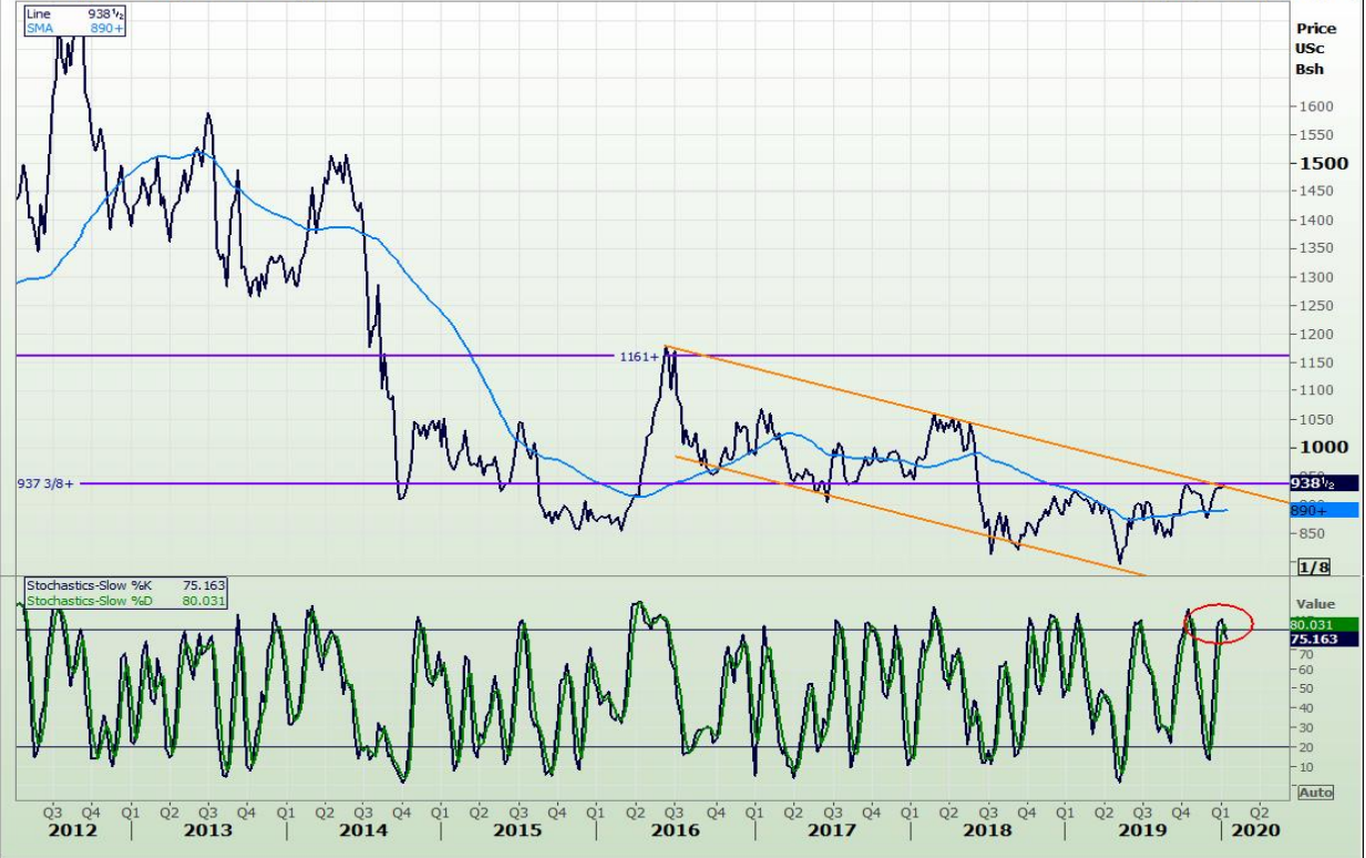
Daily SOYBEANS MAR0