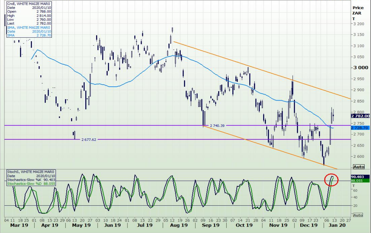
Daily YELOW MAZE MAR0