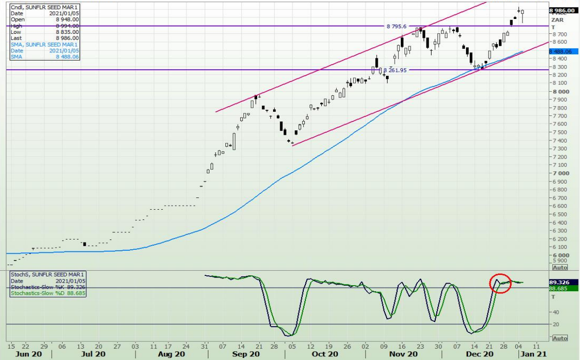
Daily SUNFLR SEED MAR1