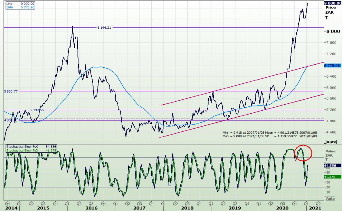
Weekly SAFEX Sunflower - Spot