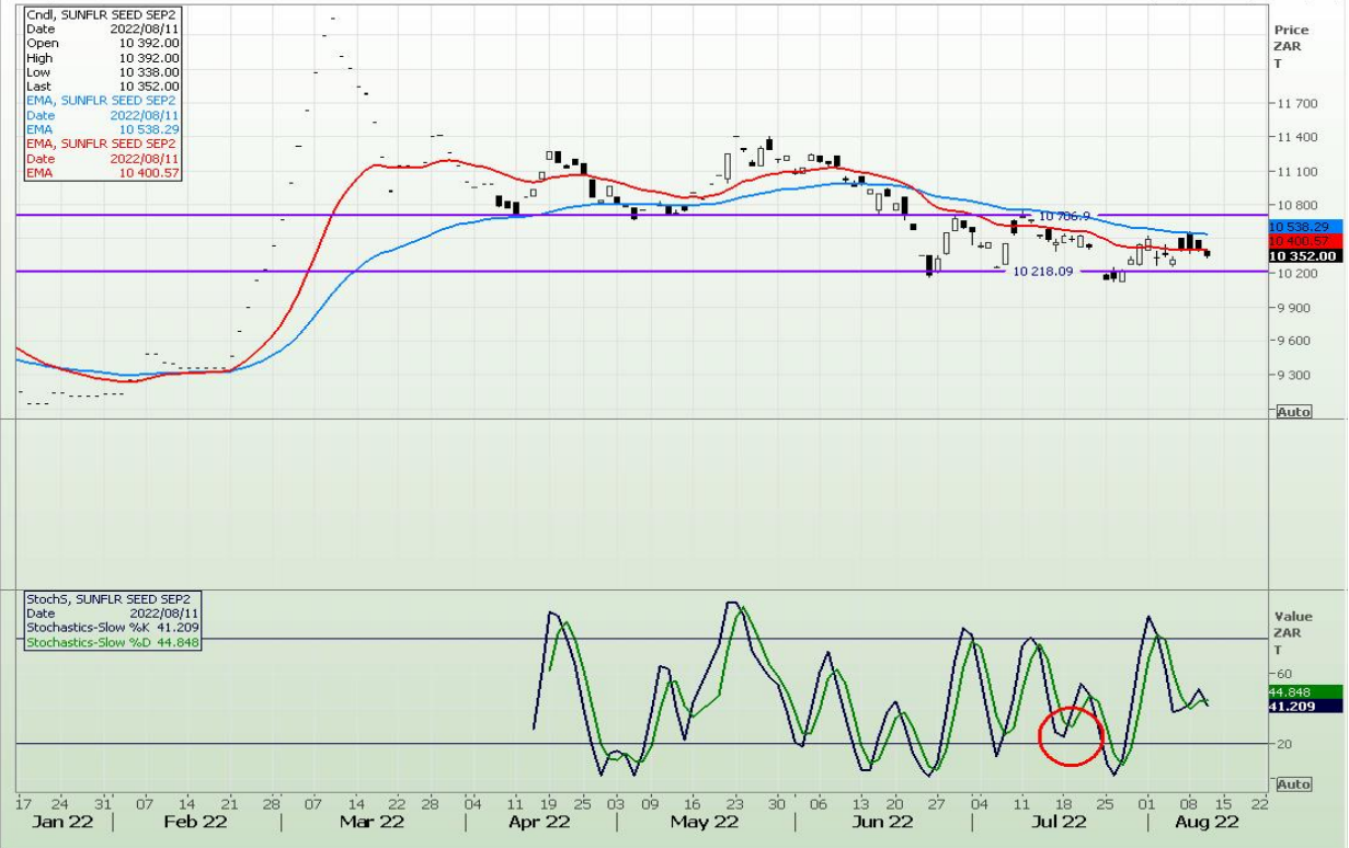
Daily SUNFLR SEED SEP2