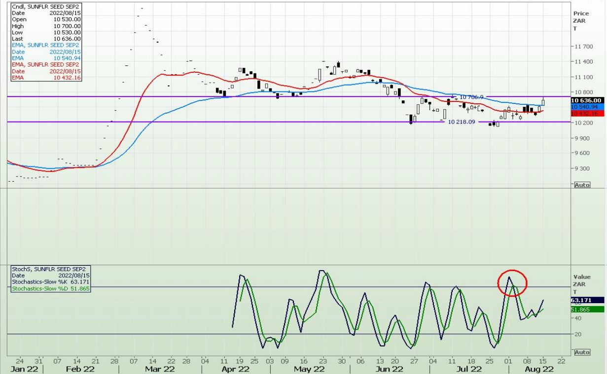
Daily SUNFLR SEED SEP2