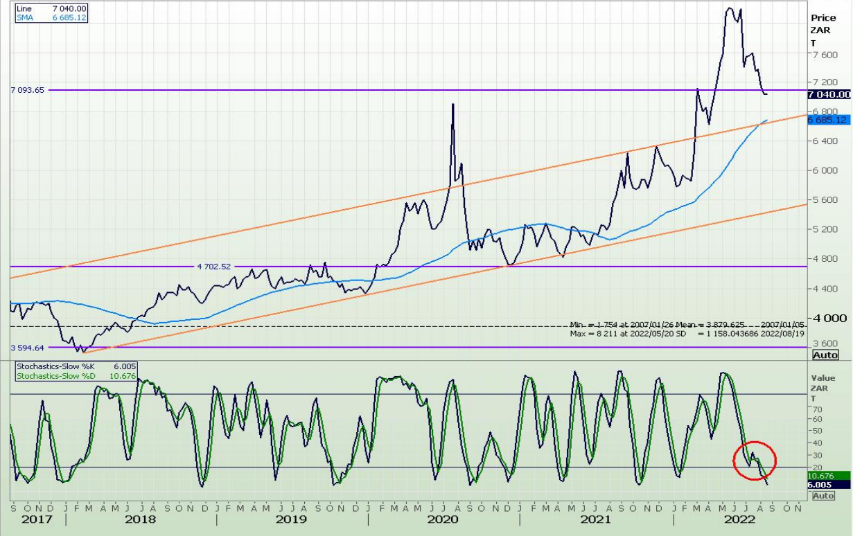
Weekly SAFEX Wheat - Spot