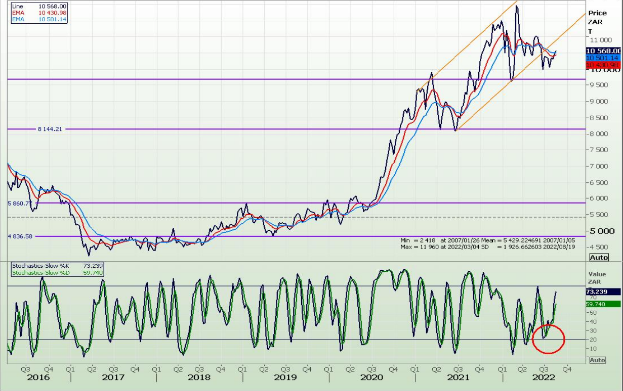
Weekly SAFEX Sunflower - Spot