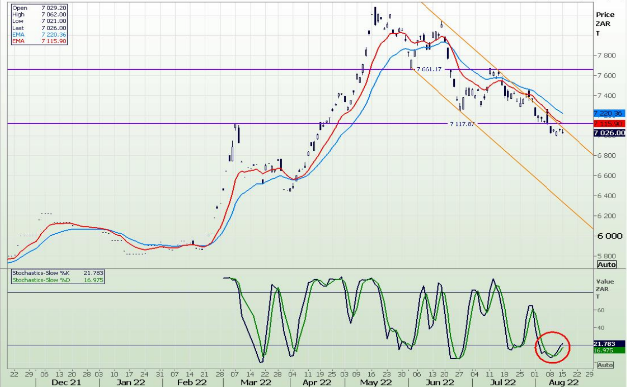
Daily WHEAT SEP2