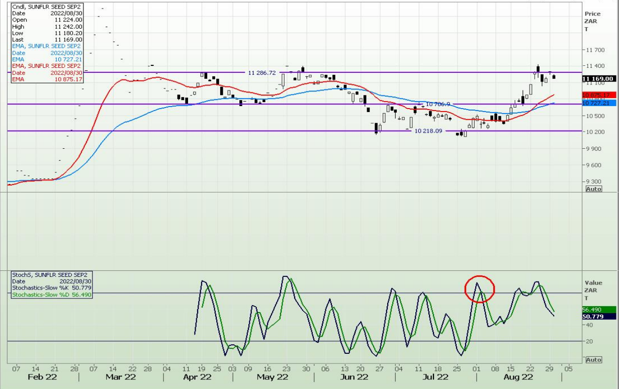
Daily SUNFLR SEED SEP2