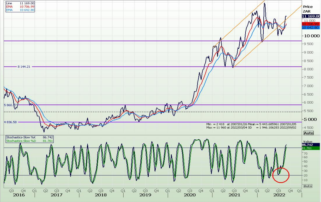
Weekly SAFEX Sunflower - Spot