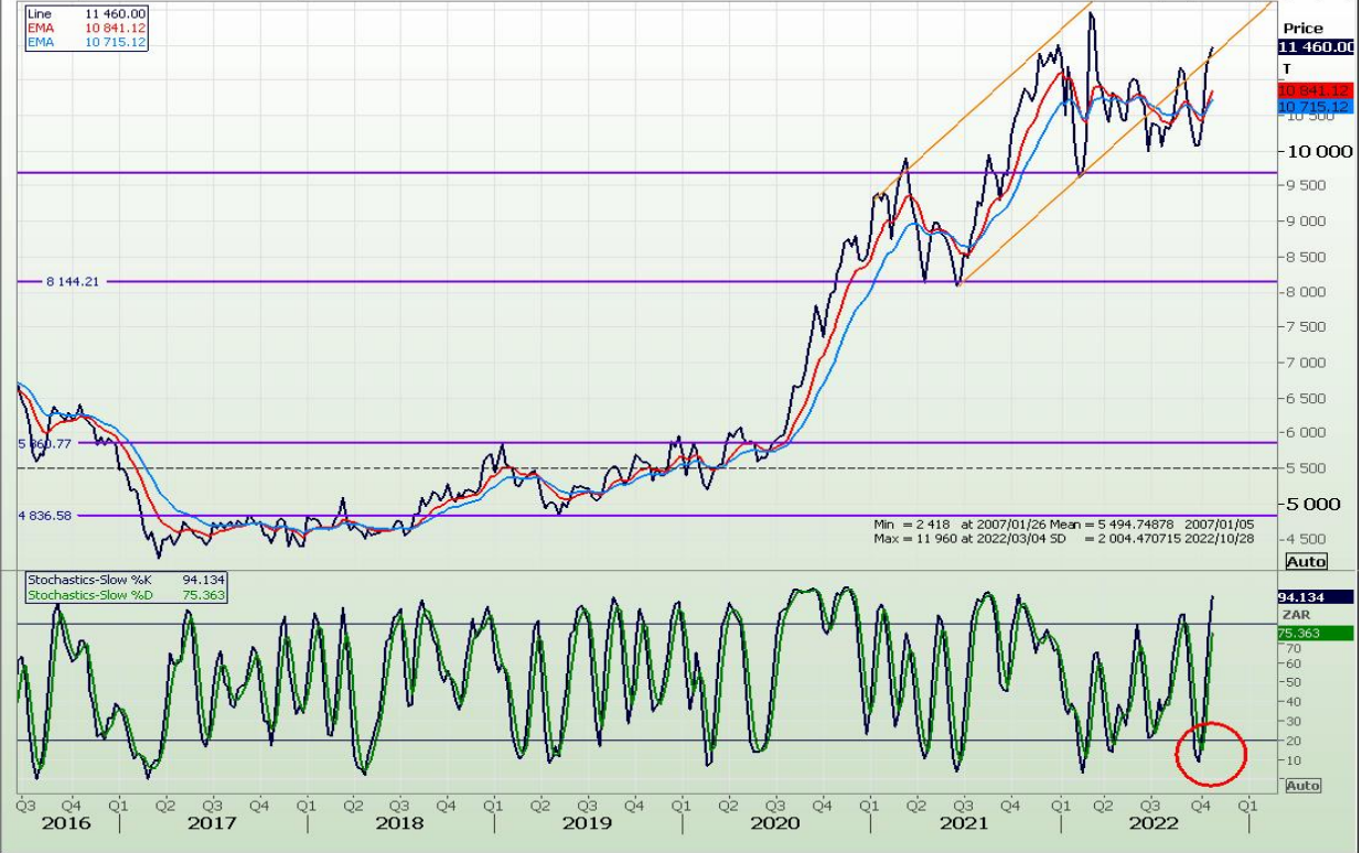
Weekly SAFEX Sunflower - Spot