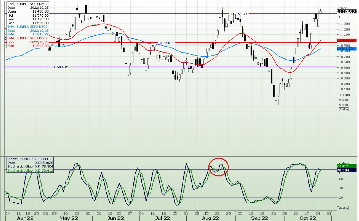
Daily SUNFLR SEED DEC2