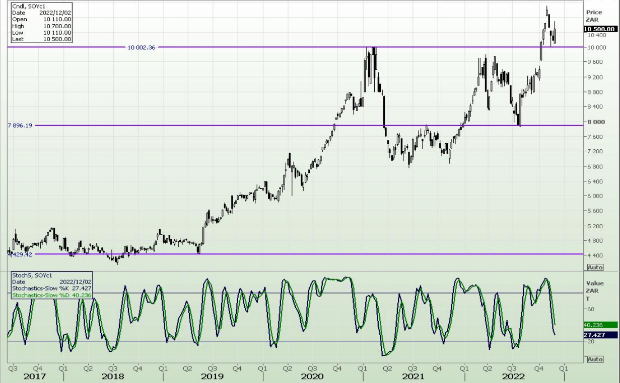
Daily SOYABEANS MAR3, SOYABEANS DEC2