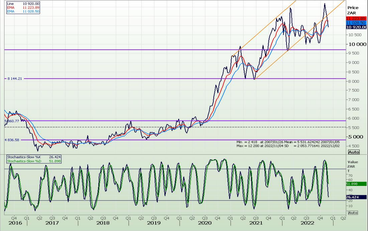
Weekly SAFEX Sunflower - Spot