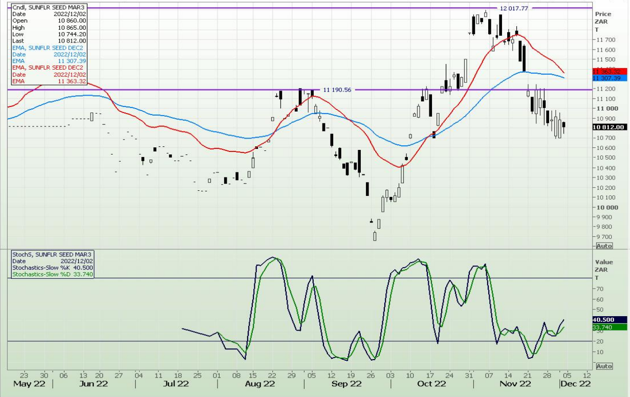
Daily SUNFLR SEED MAR3, SUNFLR SEED DEC2