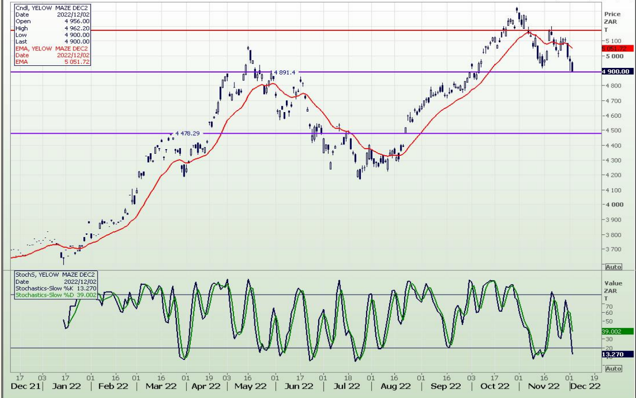
Daily YELLOW MAZE DEC2