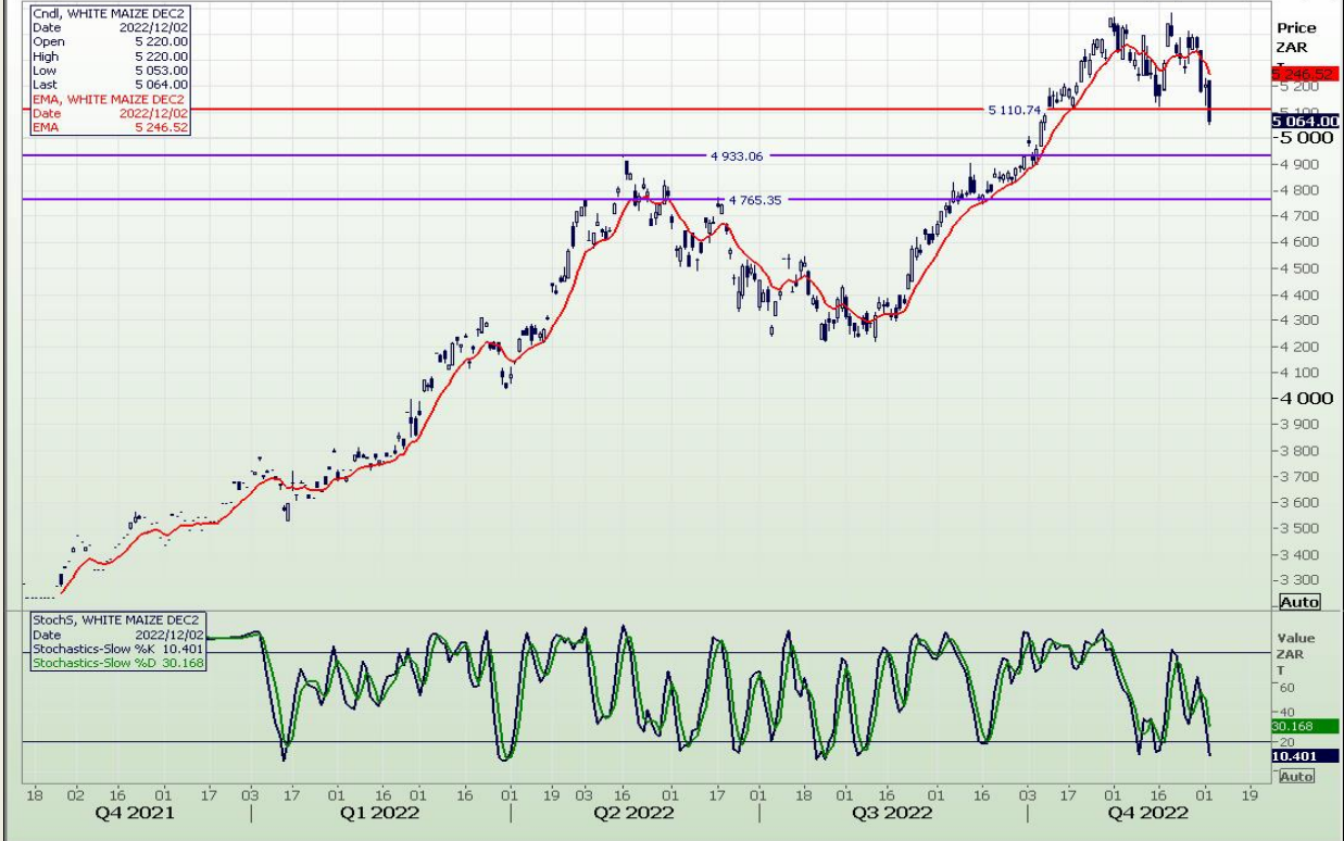
Daily WHITE MAIZE DEC2