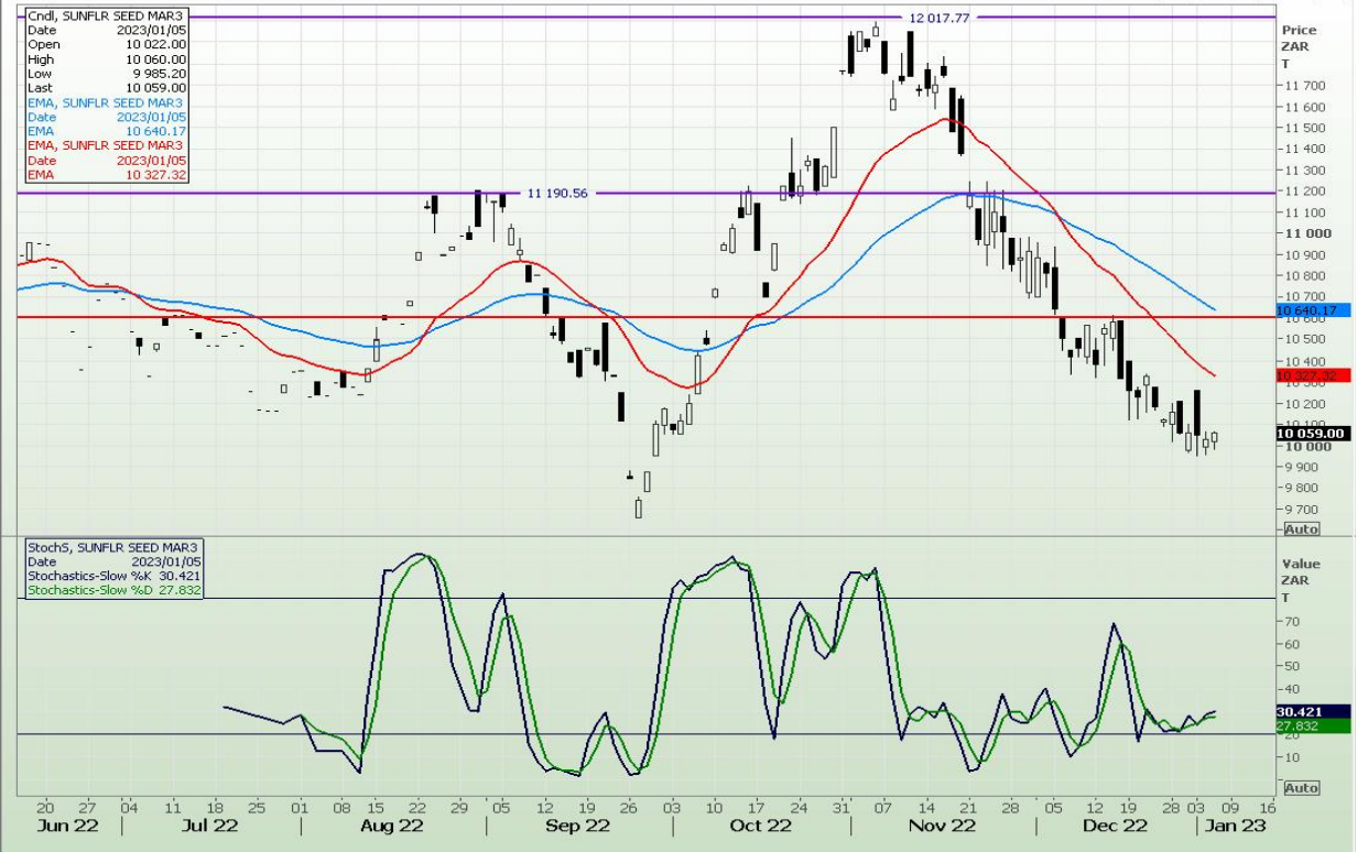
Daily SUNFLR SEED MAR3