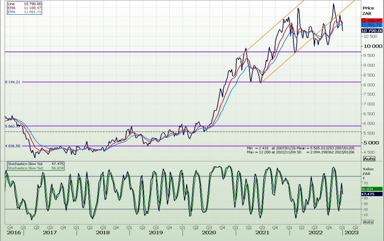
Weekly SAFEX Sunflower - Spot