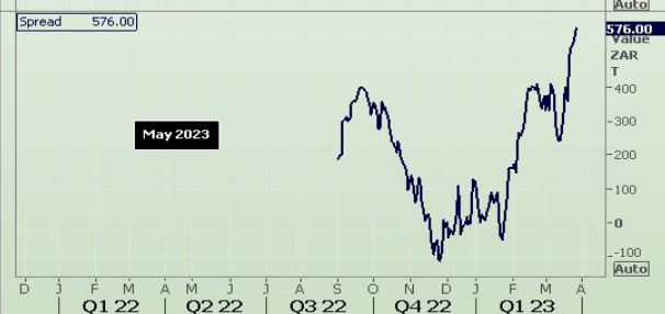
Daily Corn / White Maize Split